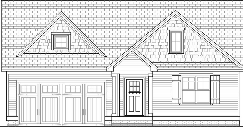
FRONT ELEVATION - B