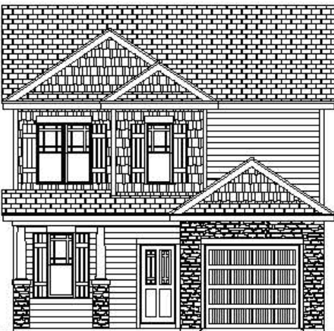
FRONT ELEVATION C