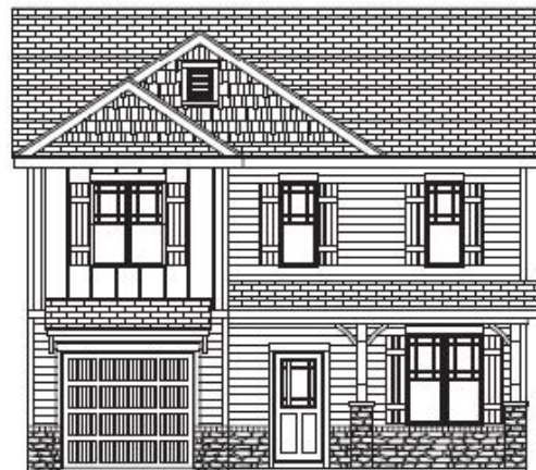
FRONT ELEVATION C