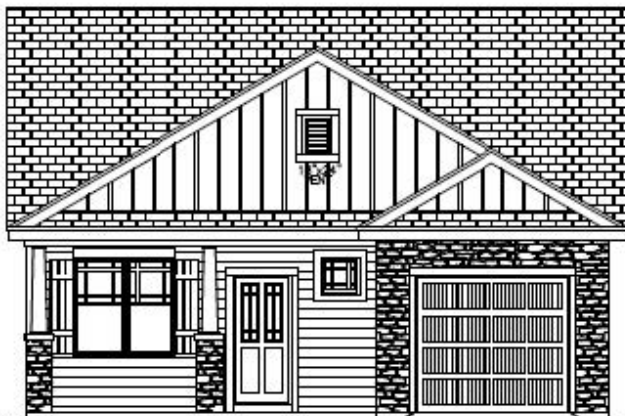
FRONT ELEVATION C