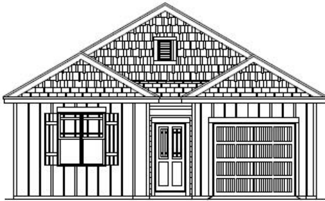
FRONT HOUSE ELEVATION B