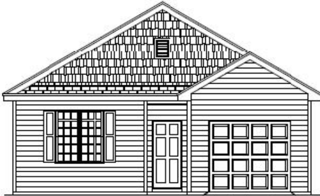
FRONT HOUSE ELEVATION A