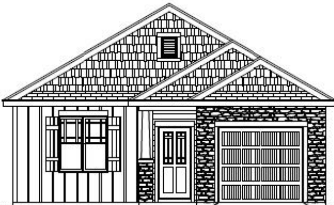
FRONT HOUSE ELEVATION C